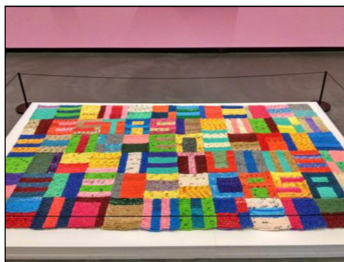
Installation view of Antonia Perez's "Estas En Tu Casa" (2015)

Txt: art, language, media continues at the Sugar Hill Children's Museum of Art & Storytelling (898 St Nicholas Ave, Harlem, Manhattan) through February 14.