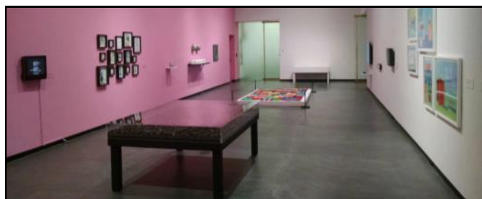
Installation view of 'Txt: art, language, media' at the Sugar Hill Children's Museum of Art & Storytelling

The inclusion of Vuk Ćosić in this show is an interesting addition. Ćosić has been credited with the invention of